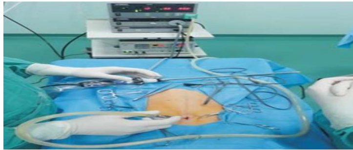
Figure 2: Laparoscopic ovariohysterectomy in a bitch.

invasive procedure is thought to reduce the neuroendocrine, immunologic and metabolic response of the organism compared to laparotomic surgery [54]. Laparoscopic surgery consists of the veterinarian making two to three small incision sites on the abdomen followed by using carbon dioxide gas to inflate and extend the abdominal area [55]. Then, using laparoscopes, the veterinarian can visualize the reproductive tract. The blood vessels are ligated using clips, suture, or vessel-sealing devices, and the tools are used to grasp and manipulate the reproductive organs. This approach is popular because it's less traumatic than a traditional spay, however, it is much more expensive and takes a longer time to perform (Figure 2).