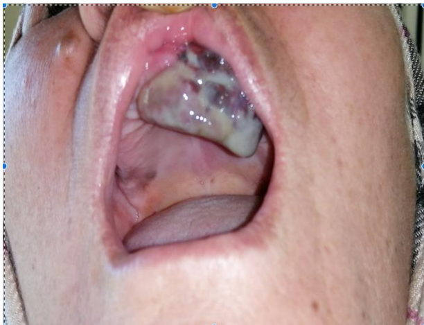
Figure 2: Facial scanner shows a tumor.

A tumor extension assessment was done the PET-scan and cervical thoracic scan were normal. For this a surgical management was chosen.