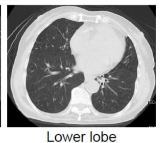
Figure 2: Chest computed tomography findings before and after the first treatment.