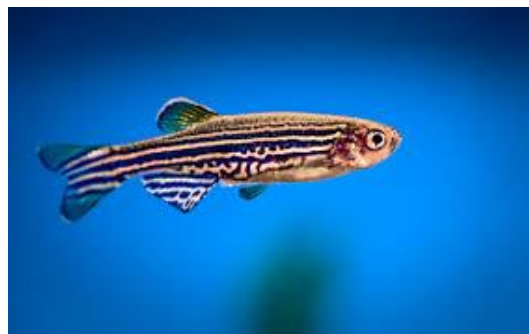
Figure 1: Zebra fish.

fish has fewer pink traces with blue strips and heavier than male zebra fish. Zebra fish has 2-3 year life span but in ideal condition it is extended to 5 years [4,5].