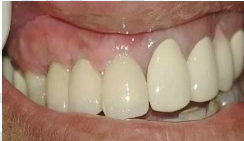
Figure 7: Successful clinical and esthetic outcome in the treated case as revealed on the follow-up visit of the patient after 6 months.