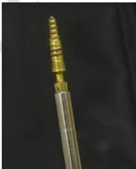
Figure 4: BCES EX ® implant system with a smooth surface implant revealing active threads for cortical engagement.