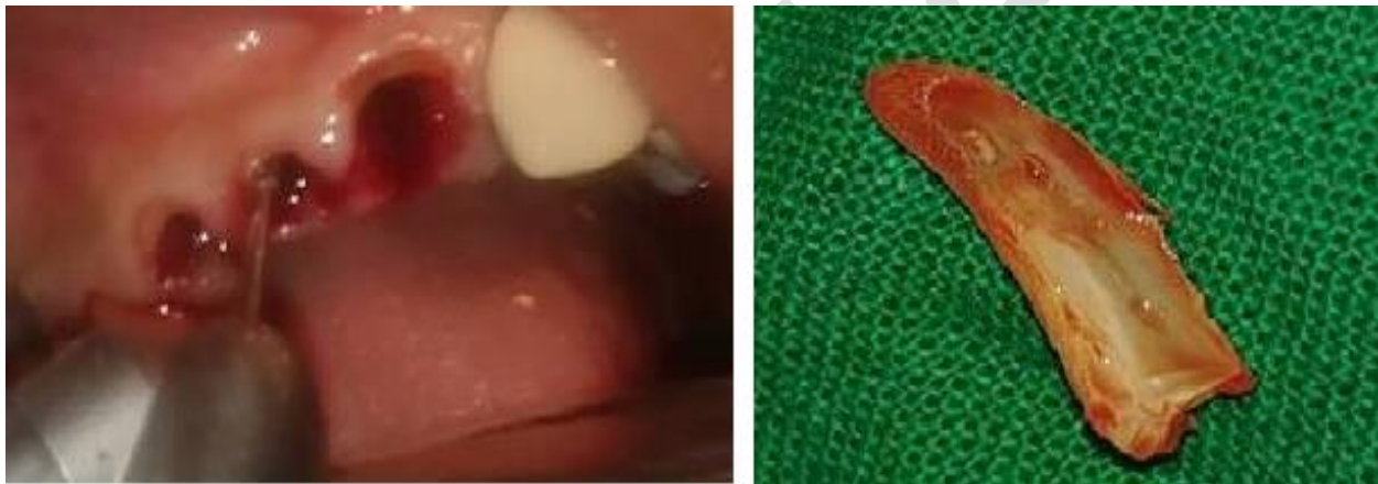
Figure 3A & Figure 3B: Palatal aspect of the tooth removed using a periotome.