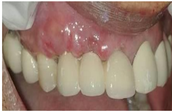
Figure 6: Inflamed soft tissues in the treated area due to surgical manipulation of the tissues.