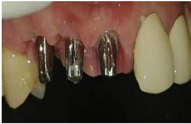
Figure 5: Immediate final prosthesis provided in the present case using metal framework as a rigid splint.