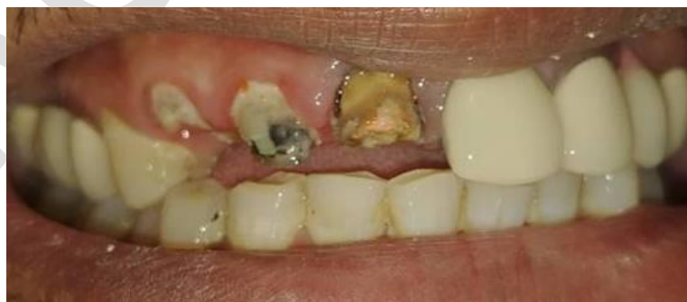
Figure 1: Grossly destructed teeth in maxillary anterior region.